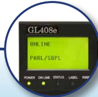
Large LCD Display Panel