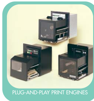
PLUG-AND-PLAY PRINT ENGINES