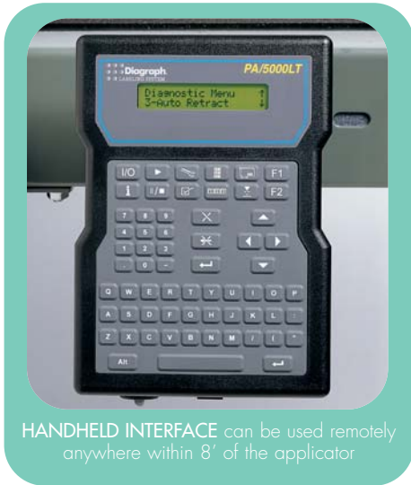
HANDHELD INTERFACE can be used remotely anywhere within 8' of the applicator