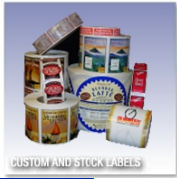
CUSTOM AND STOCK LABELS